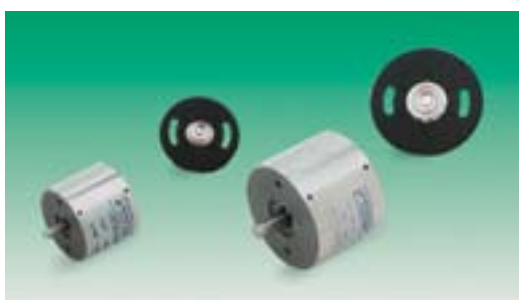
35 & 50mm rotary with optional spring return assembly